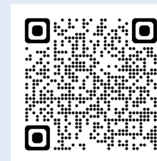
Melatonin Brand names: Circadin, Slenyto