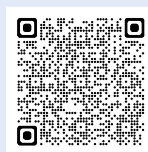
Sodium Valproate (or valproic acid) Brand names: Epilim, Episenta, Convulex, Episenta, Epival