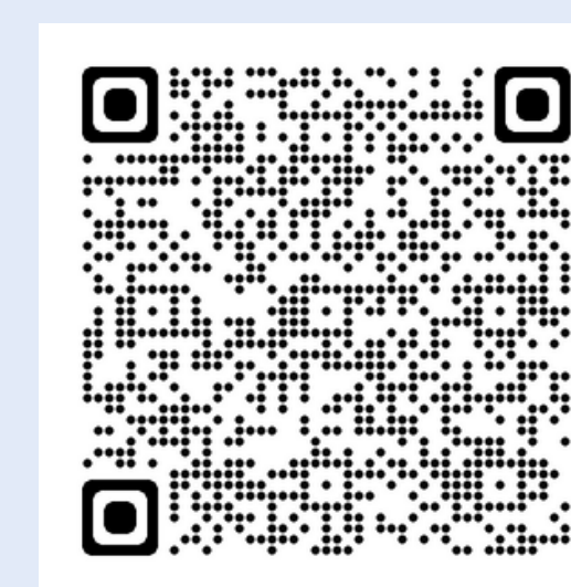
Stiripentol Brand name Diacomit