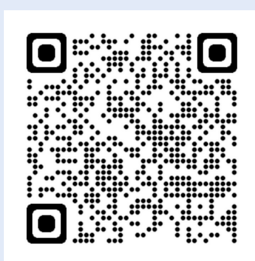
Clobazam Brand name: Fruisium