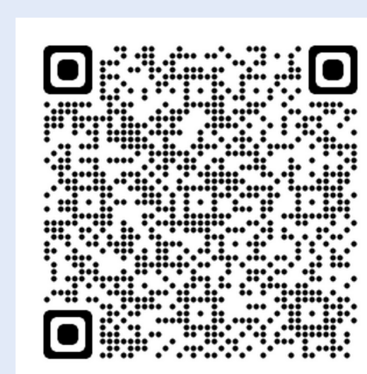
Levetiracetam Brand names: Keppra, Desitrend