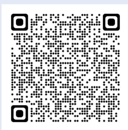
Carbamazepine Brand name: Tegretol, Carbagen