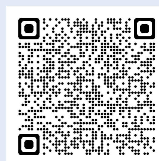
Vigabatrin Brand name: Sabril